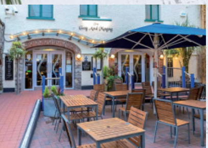
The Gog & Magog, Plymouth