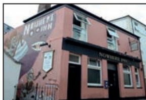
What Norm calls one of the only true British pubs in Plymouth City Centre.

walks of Plymothians. I was clutching the Shamrock Stout, my new favorite beer. I couldn't believe it: Here was a rich, multi-dimensional, malty, smooth, and totally drinkable real ale. It tasted good served at room temperature from barrels perched on the bar. Surrounded by damp drinkers ducking to move among the eaves, the sound of rain drumming between sets, this was exactly what I thought a British beer should taste and feel like.