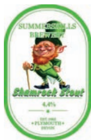
The first ale I really loved.

lacked front teeth? The sweet concoctions didn't seem to match drinker's hard demeanor. Sadly, real ale was the biggest let-down of the bunch. Locals cooed about CAMRA, the Campaign for Real Ale, which was explained to me as a volunteer-based organization that held British beer to certain standards. The CAMRA website told me it had been "campaigning for real ale, pubs, & drinks rights since 1971." Drinker's rights?! People here walked the streets carrying beers, waited for the bus carrying beers, drank beer for lunch with their bosses. What more rights' could they possibly need?!